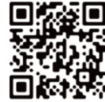
Scan the QR code to obtain the electronic version of "POLICY INTERPRETATION OF BUSINESS ENTRY IN SHANGHAI"